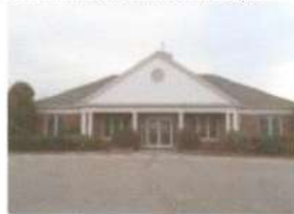
View of the North side of the building.

The 6000 sq/ft building was built for a Bank in Holden, Maine and has been empty for several years due to that bank being bought out by another bank in the area. The building is at the intersection of US 1A and SR46 and is about 7 miles from Bangor.